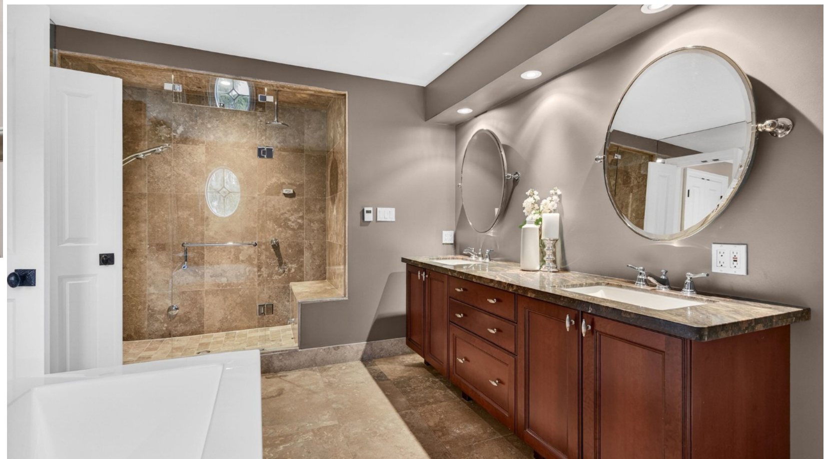
Upstairs, the layout offers a sense of separation that is increasingly valued, with the primary suite positioned as its own retreat, apart from the additional bedrooms.